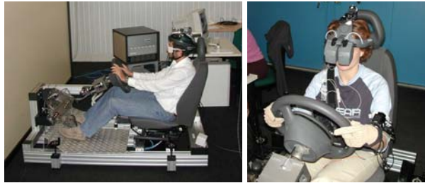
Figure 3. The mock-up configuration using shutter glasses (left) or HMD (right).

and the virtual environment. They are located on objects for which high precision is required: one in the gearshift, one in the steering wheel and the last one on the seat. These positions define a coordinate system for the real world and for the virtual world.