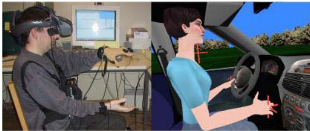
Figure 4. The virtual configuration.

Figure 4 illustrates the avatar being controlled by the user wearing VR devices. Figure 5 illustrates the case when simple spheres are used to represent hand positions. These visual spheres provide sufficient information to let the user interact with the steering wheel and gearshift in the Virtual Configuration modes. Figure 6 illustrates the notion of interaction regions.