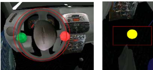
Figure 6. Main interaction regions used: a torus approximates the steering wheel shape (left), and a sphere approximates the topmost part of the gearshift (right).