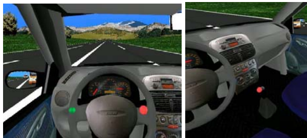
Figure 5. Spheres may also represent hand positions. Whenever a control gets attached to the user hand, the corresponding sphere changes its color.